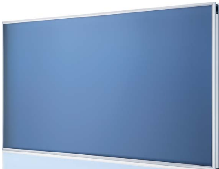
SOL 27 Premium W

The SOL 27 Premium's modern appearance seamlessly integrates with any architecture.