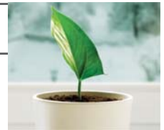
Highest ENERGY STAR rated air-source heat pump water heater