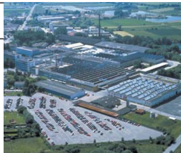
Stiebel Eltron's plant in Holzminden, Germany.

Stiebel Eltron has been a world leader in the development of advanced water heating technology for over 80 years. Our pursuit of engineering excellence and high-quality manufacturing results in products fulfilling the highest expectations of performance and reliability. They are... Simply the Best.