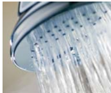
Efficient tankless electric water heaters