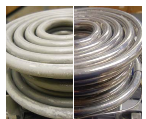
Untreated TAC Protected

Note the mineral build-up on the element exposed to untreated water vs. the element protected by TAC treatment.